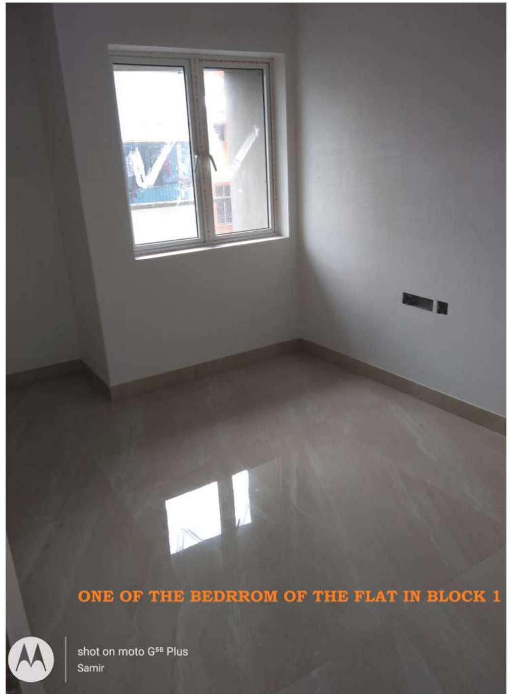
ONE OF THE BEDROOM OF THE FLAT IN BLOCK 1