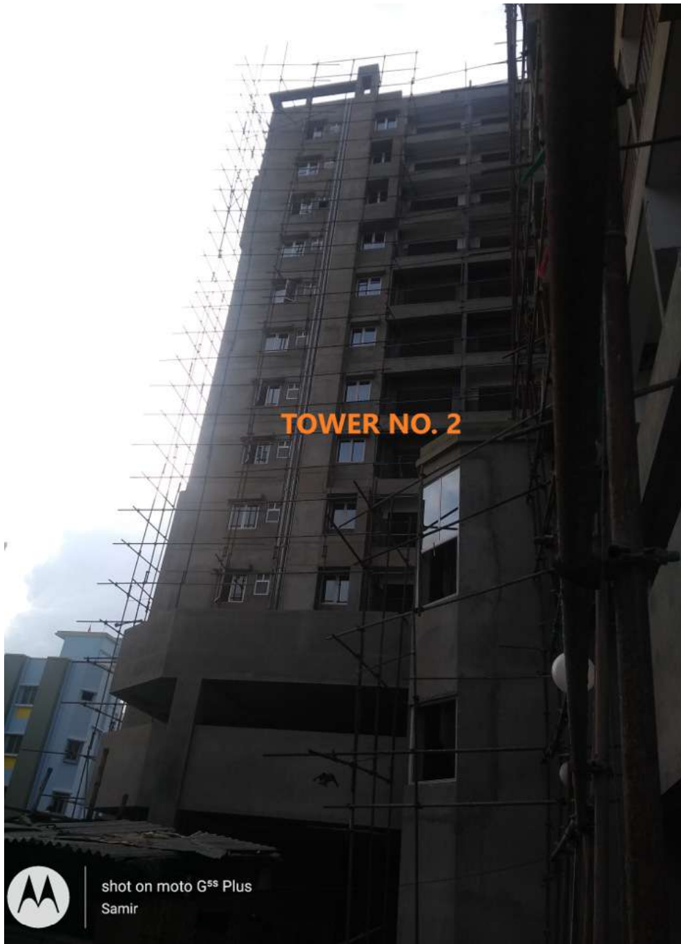
TOWER NO. 2