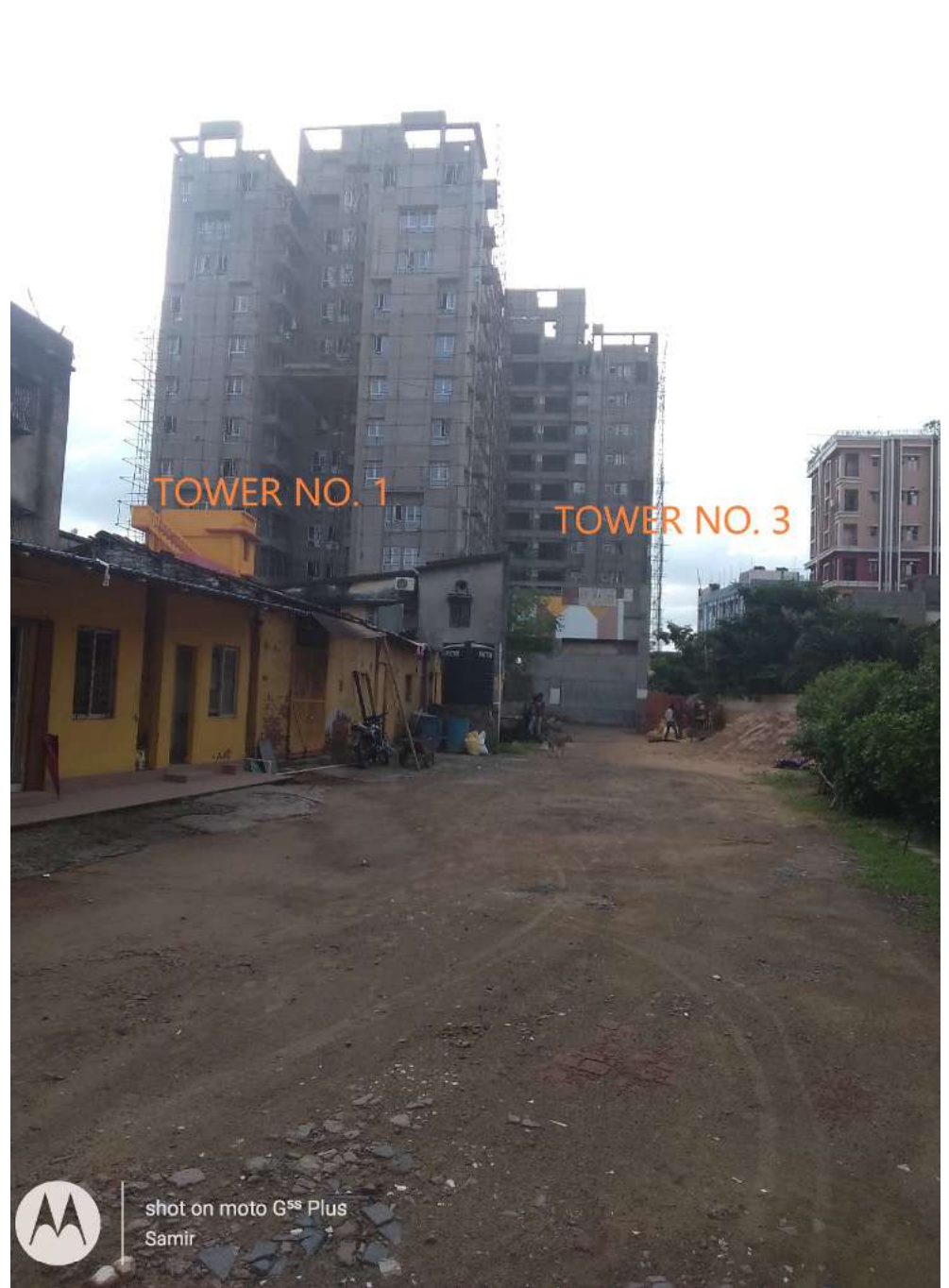
TOWER NO. 1