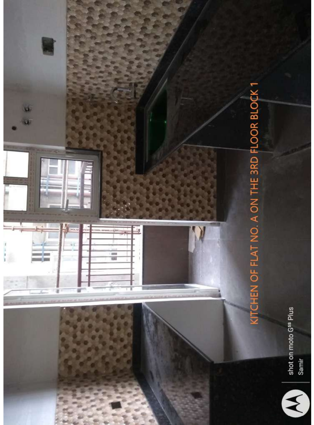
KITCHEN OF FLAT NO. A ON THE 3RD FLOOR BLOCK 1