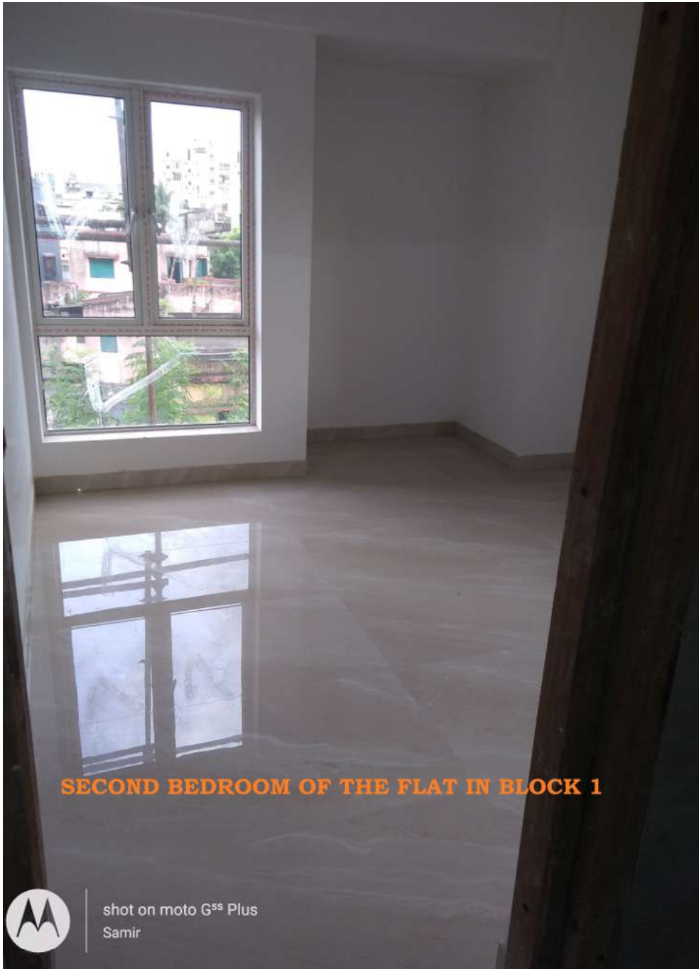
SECOND BEDROOM OF THE FLAT IN BLOCK 1