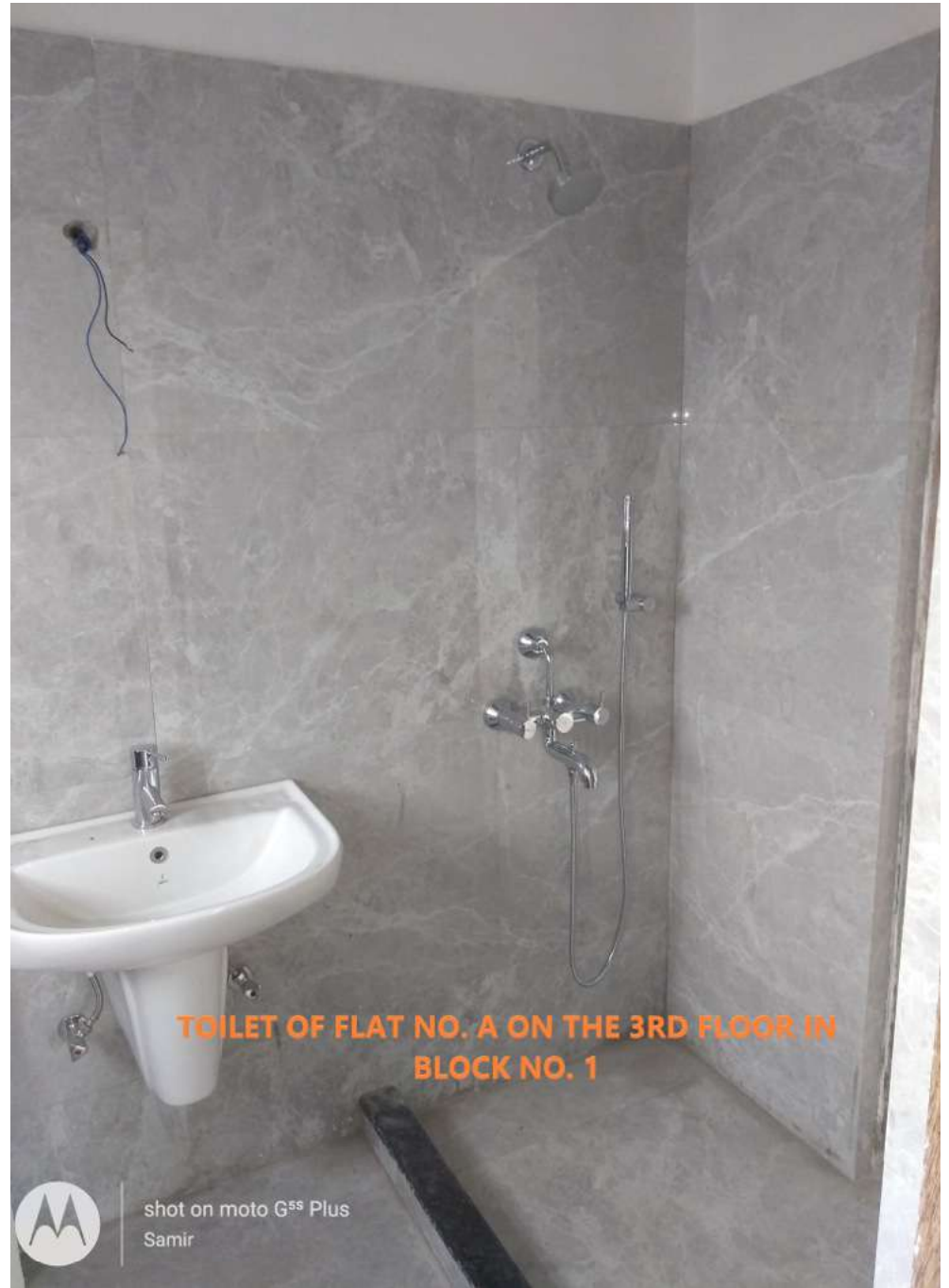
TOILET OF FLAT NO. A ON THE 3RD FLOOR IN BLOCK NO. 1