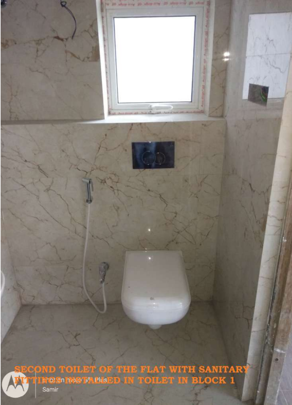
SECOND TOILET OF THE FLAT WITH SANITARY FITTINGS INSTALLED IN TOILET IN BLOCK 1